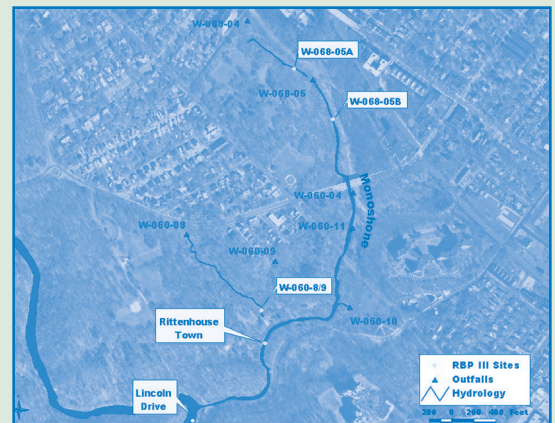
Aerial View of the Monoshone Watershed:

The above aerial photograph shows the Monoshone Creek and the locations of the Water Department's stormwater outfalls along the creek. Outfall Number 5, which receives the largest volume of stormwater runoff due to the size of the drainage area, is the location where PWD takes its quarterly fecal coliform sample.