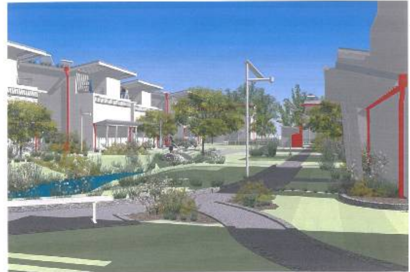
View of Central Park

Development strategies should promote the capture of stormwater runoff from streets and sidewalks within those rights of way and other adjacent public spaces.